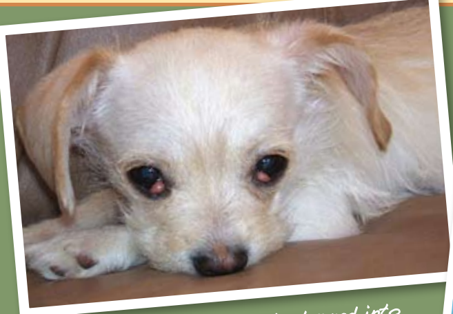
STUART LITTLE: Heartache turned into heart throb. Fostered and adopted.

Over 9 million animals are euthanized each year in the U.S. because there are not enough homes for them all. 56% of dogs and 71% of cats that enter shelters are put down primarily due to lack of shelter space. The numbers are mind boggling and many people feel overwhelmed not knowing how to best assist with this tragic situation.